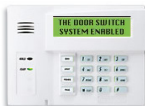
Example of Basic Monitoring Keypad Console

All system components are electronically supervised and will notify if maintenance is required. Monitored doors can be isolated from the system during maintenance.